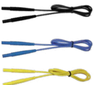
Test lead 1.2 m CAT III/1000V CAT IV/600V black/blue/yellow