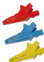
Crocodile clip, 1 kV 20 A red/blue/yellow