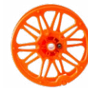
Test wire reel