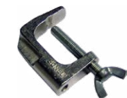
Clamp terminal with banana plug termination